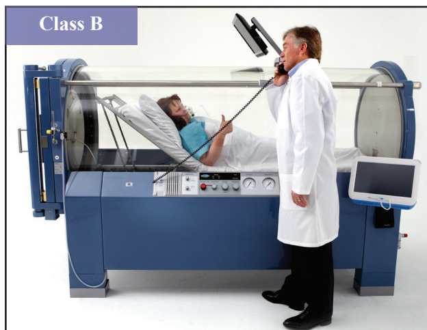
Figure 2. Monoplace Chamber